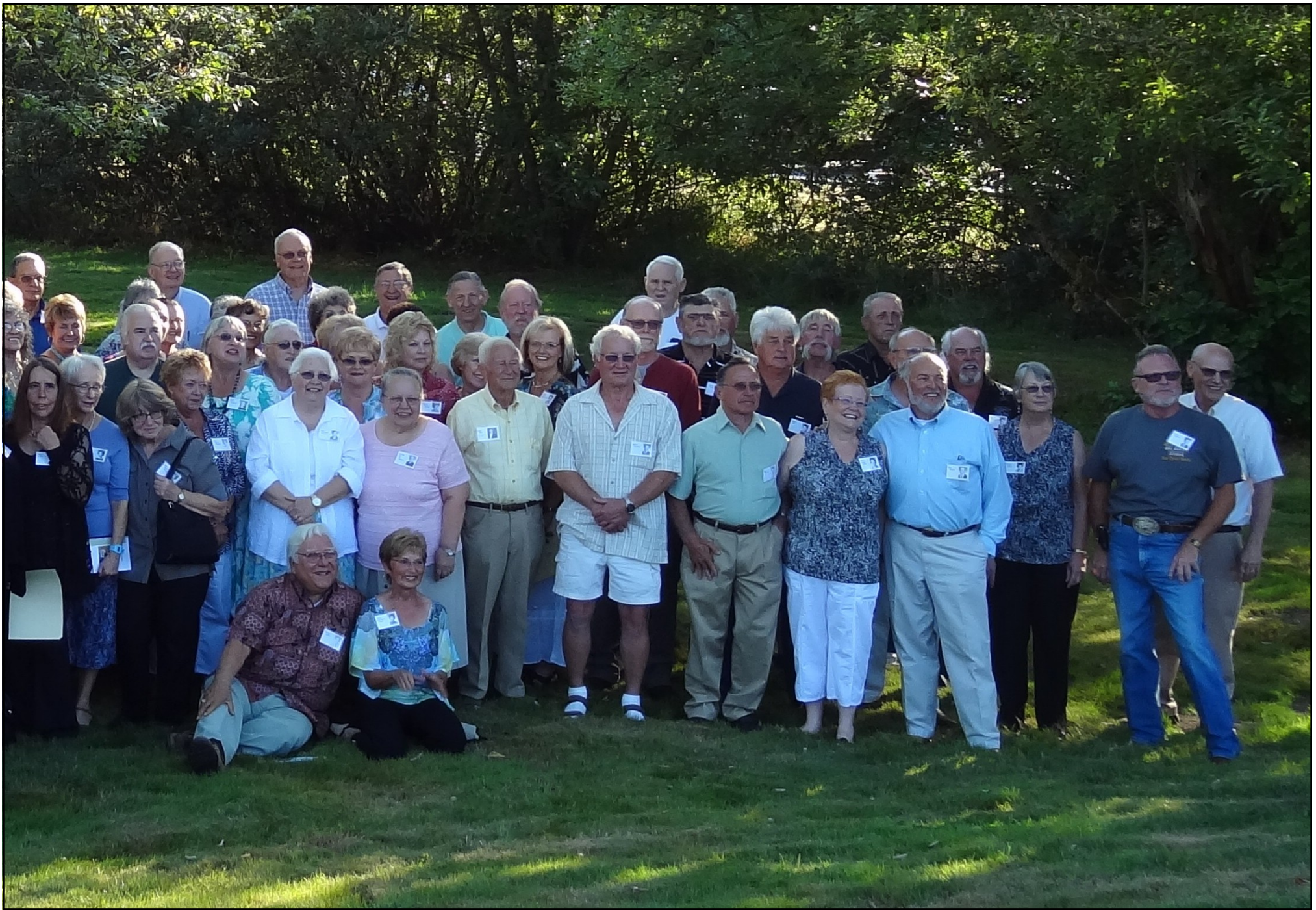
Class Reunion Photo August 25, 2012 - 2nd Half of photo