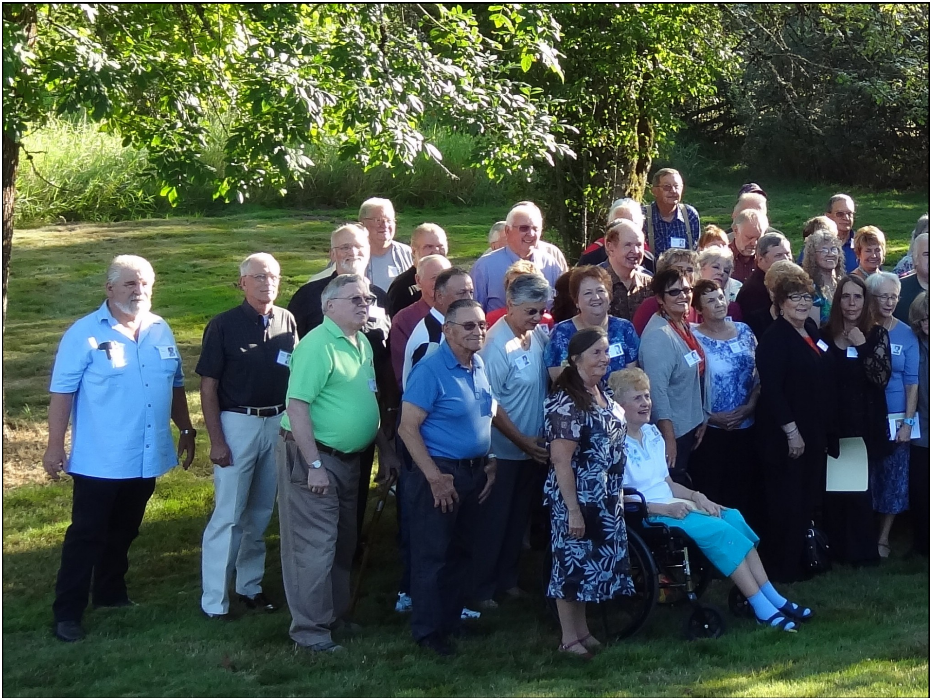
Class Reunion Photo August 25, 2012 - 1st Half of photo