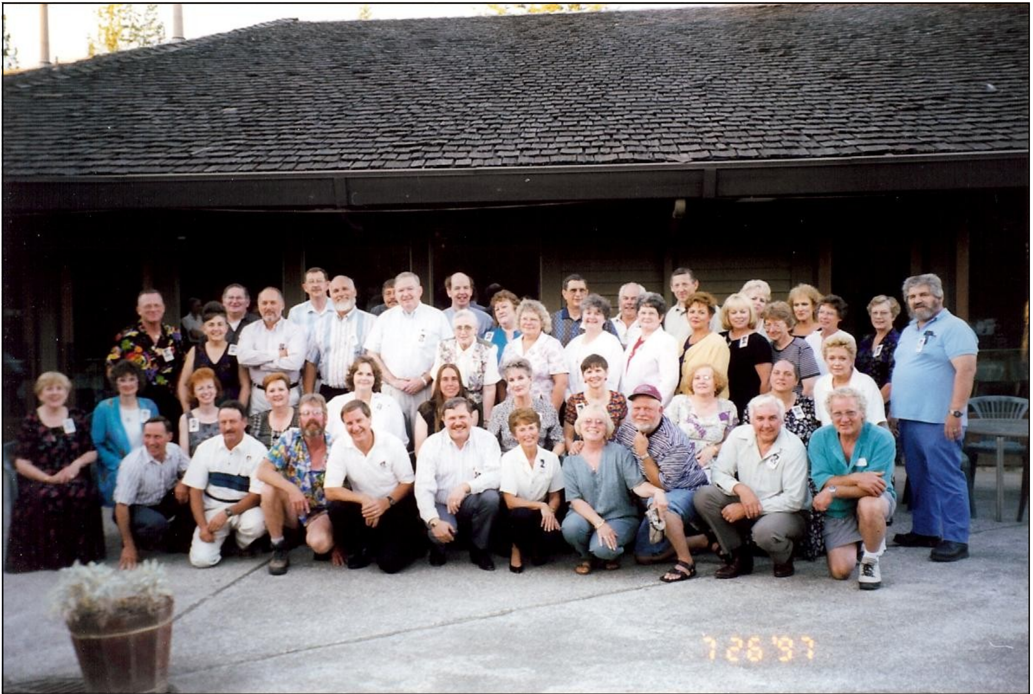
Class Reunion Photo July 26, 1997